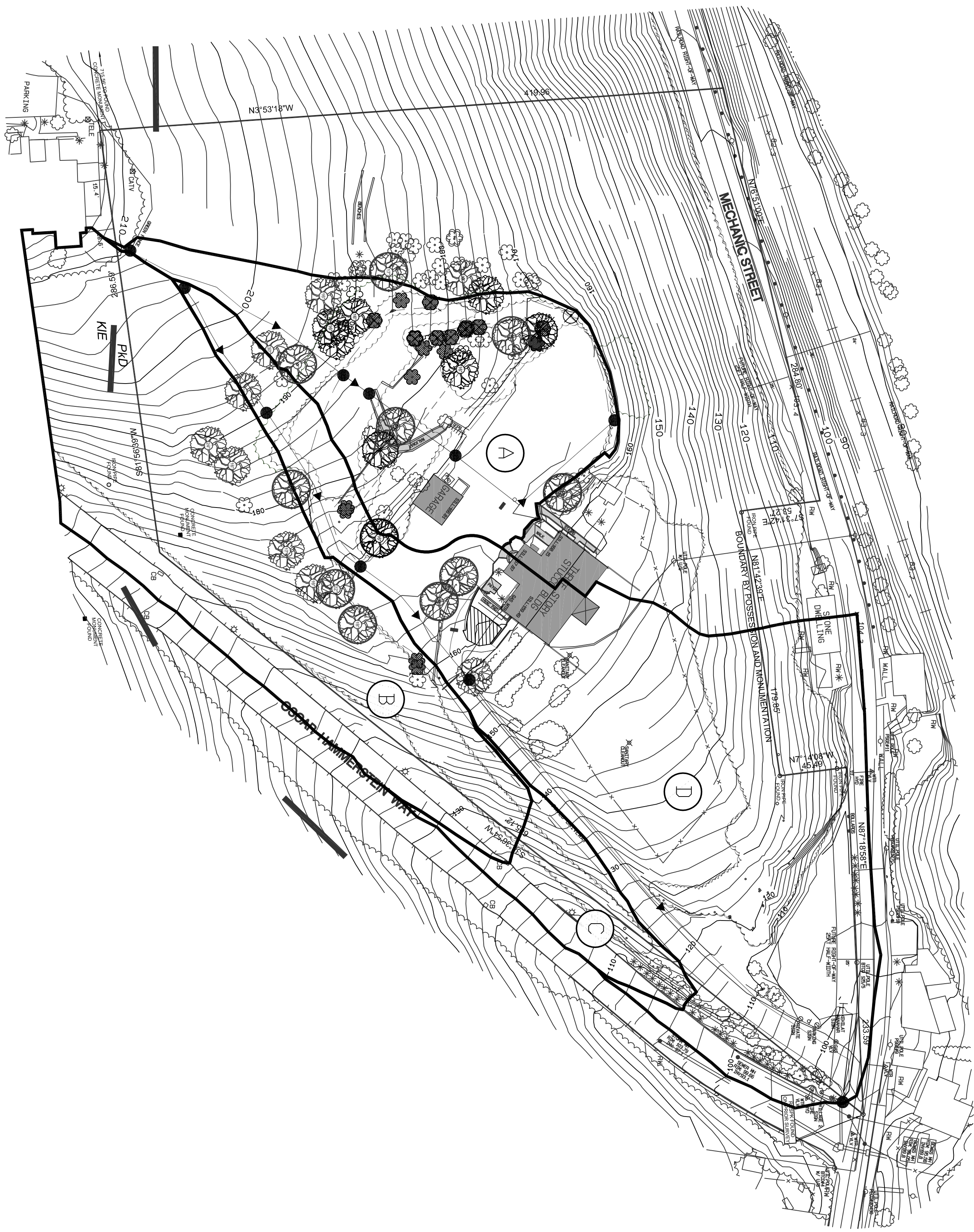
PRE-DEVELOPMENT DRAINAGE AREAS